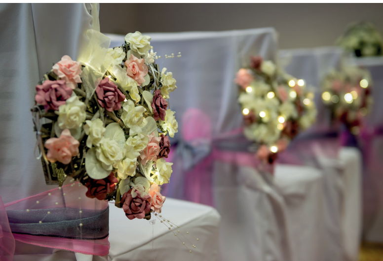
Top; photography courtesy of David Webb North East Wedding Photographer Bottom; photography courtesy of S Howard Photography Ltd